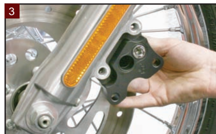
3 Install the Jaybrake Defender RoadLoK unit into the caliper mount holes on the lower leg.