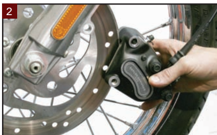
2 Dismount the brake caliper.