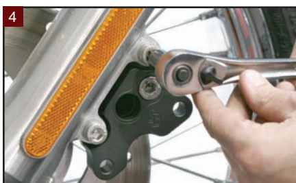
4 Tighten the mounting hardware.