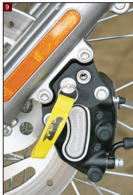
9 The Jaybrake Defender RoadLoK is now in the locked position, and so the front wheel cannot roll. The yellow flag on the RoadLoK pin tells any potential bike thief that the bike is locked.