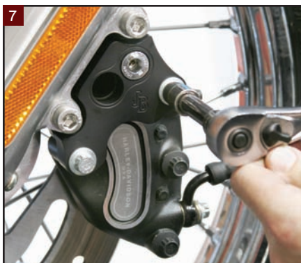
7 Tighten the caliper hardware.