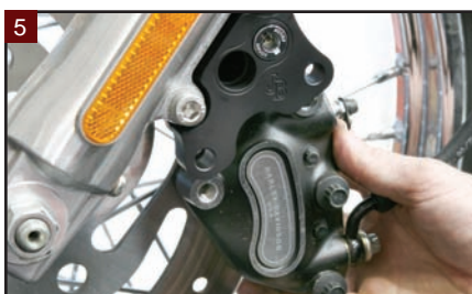
5 Install the brake caliper on the Defender RoadLoK mounting holes.