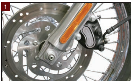
1 This is the stock caliper setup on the 2007 Softail.