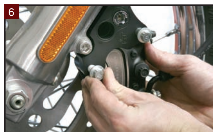
6 Use the stock caliper mounting hardware to hold the caliper in place.