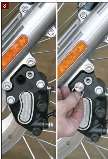
8 Using one of the supplied keys, insert the locking pin through the Defender RoadLoK and one of the brake rotor holes. This prevents rotor movement.